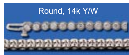
Round, 14k Y/W